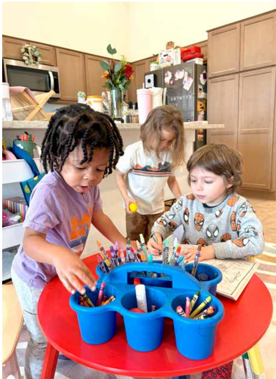
Art time at the new table sparks imagination and collaboration.

These gaps show that Universal Child Care is not only about reducing cost barriers; it is about ensuring educators have the support, training, and pay to meet families’ needs. Statewide, educators benefit from support offered by Growing Up New Mexico, a local